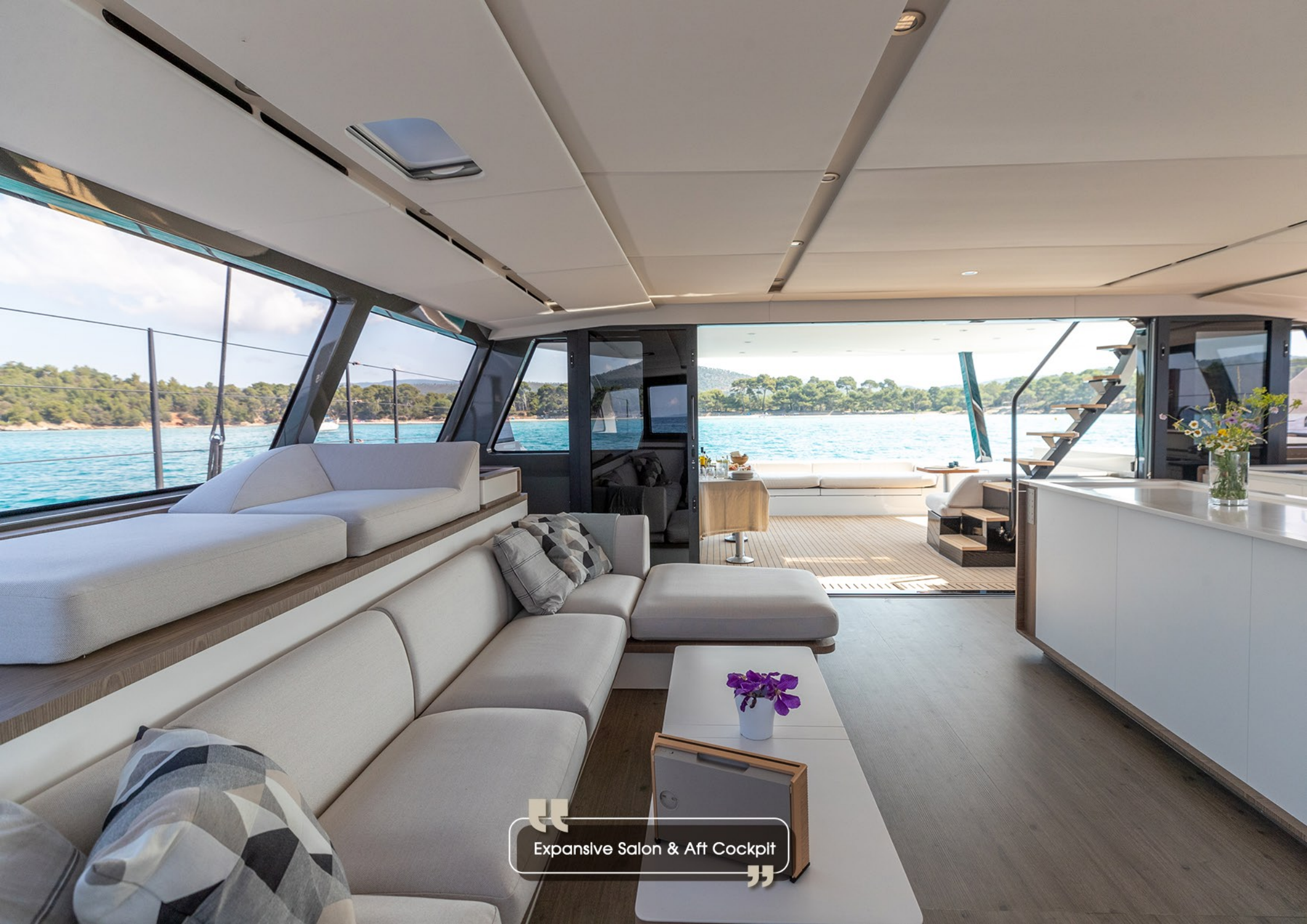
“ Expansive Salon & Aft Cockpit ”